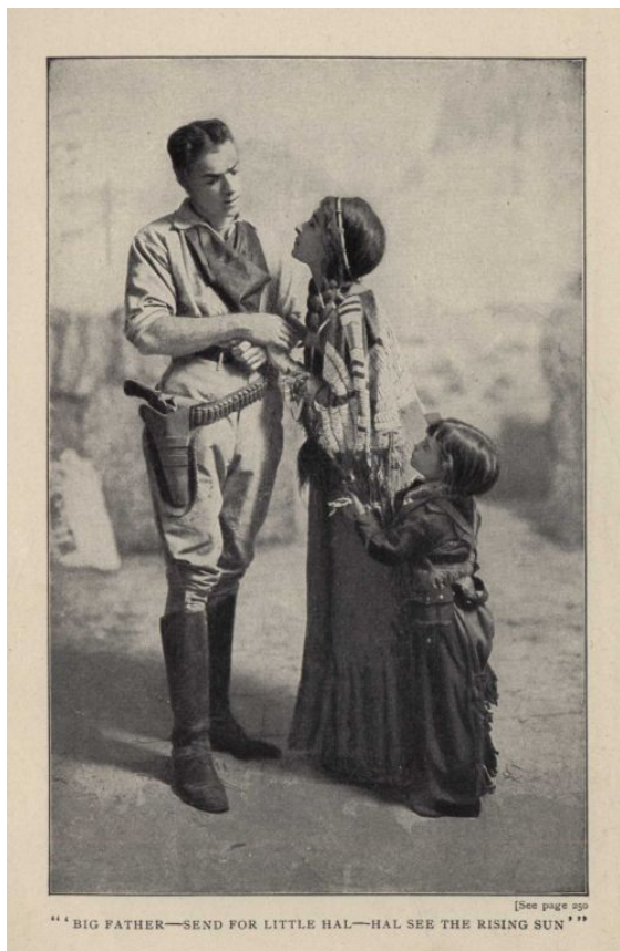
“BIG FATHER—SEND FOR LITTLE HAL—HAL SEE THE RISING SUN” See page 250